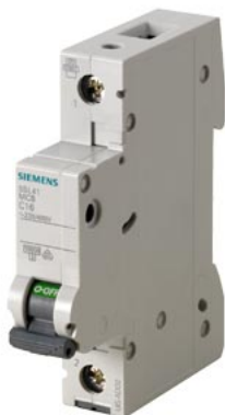
Miniature circuit breaker 230/400 V 10kA, 1-pole, B, 16A