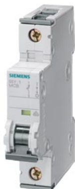
Miniature circuit breaker 230/400 V 15kA, 1-pole, B, 10A, D=70 mm