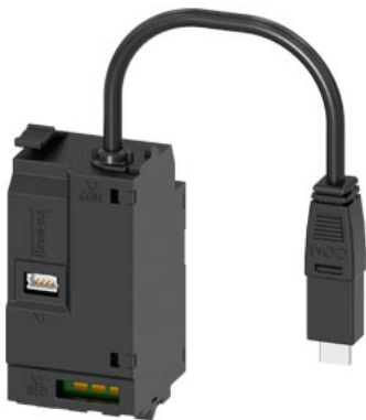
communication module COM060 accessory for: 3VA2 100/160/250