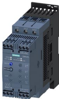
SIRIUS soft starter S2 72 A, 37 kW/400 V, 40 °C 200-480 V AC, 110-230 V AC/DC Screw terminals