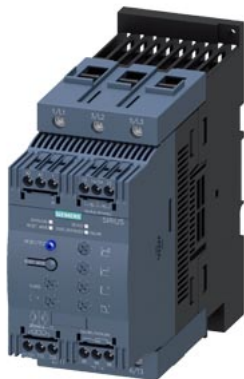
SIRIUS soft starter S3 106 A, 55 kW/400 V, 40 °C 200-480 V AC, 24 V AC/DC Screw terminals Thermistor motor protection