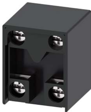
Contact block for position switch 3SE51/52 1 NO/1 NC slow-action contact