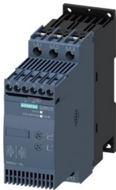
SIRIUS soft starter S0 32 A, 15 kW/400 V, 40 °C 200-480 V AC, 110-230 V AC/DC Screw terminals